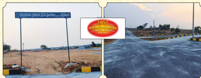
1957 REVIVING REVOLUTION @ BHONGIR, YADADRI