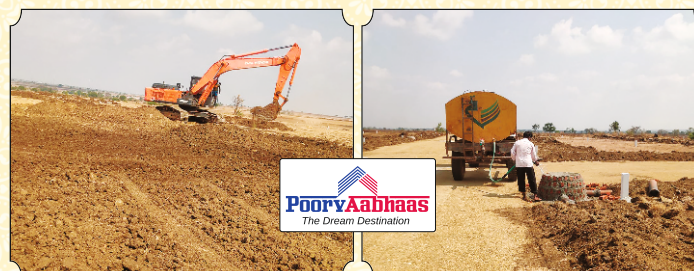
POORVAABHAAS @ KONDURG